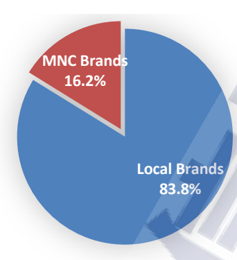
Chart 2: May 2021 mobile phone shipments by local and MNC brands

YTD local brands of Mobile phone shipments were 130.7 million, up 16.7 percent y/y, and accounted for 88.0 percent of the domestic mobile phone shipments. Number of new models released by the local brands were 166, increased by 11.4 percent y/y, and represented 91.7 percent of the total number of new models.