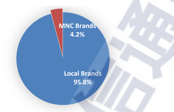
Chart 2: June 2021 mobile phone shipments by local and MNC brands

YTD local brands of Mobile phone shipments were 155.3 million, up 11.5 percent y/y, and accounted for 89.2 percent of the domestic mobile phone shipments. Number of new models released by the local brands were 194, decreased by 1.0 percent y/y, and represented 91.1 percent of the total number of new models.