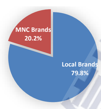
Chart 2: May 2022 mobile phone shipments by local and MNC brands

YTD local brands of Mobile phone shipments were 90.7 million, down 30.6 percent y/y, and accounted for 83.8 percent of the domestic mobile phone shipments. Number of new models released by the local brands were 160 decreased by 3.6 percent y/y, and represented 95.8 percent of the total number of new models.