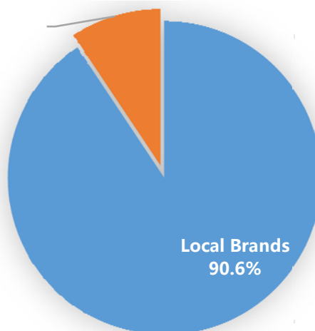
Chart 2: May mobile phone shipments by local and MNC brands

YTD mobile phone shipments by the local brands reached 184.4 million units, up 15.7 percent year over year, and accounted for 88.2 percent of the domestic mobile phone shipments. Number of new models released by the local brands (597 units) decreased by 4.0 percent year over year, representing 95.5 percent of the total number of new model release in the domestic market in the month.