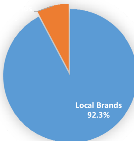
Chart 2: June 2016 mobile phone shipments by local and MNC brands

YTD mobile phone shipments by the local brands reached 225.5 million units, up 16.9 percent year over year, and accounted for 88.9 percent of the domestic mobile phone shipments. Number of new models released by the local brands (727 units) decreased by 1.2 percent year over year, representing 95.3 percent of the total number of new model release in the domestic market.