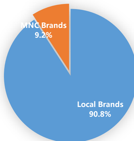
Chart 2: March 2017 mobile phone shipments by local and MNC brands

YTD mobile phone shipments by the local brands reached105.1million units, up 4.3percent year over year, and accounted for 88.8 percent of the domestic mobile phone shipments. Number of new models released by the local brands (213 units) decreased by 30.8 percent year over year,and represented94.7 percent of the total number of new model release in the domestic market.