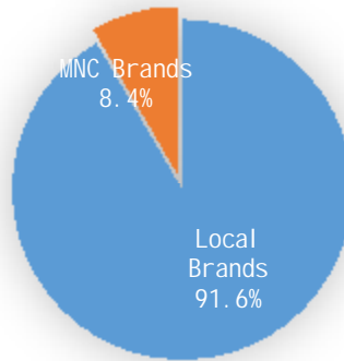
Chart 2: May 2017 mobile phone shipments by local and MNC brands

YTD mobile phone shipments by the local brands reached 177.7 million units, down 3.6 percent year over year, and accounted for 90.3 percent of the domestic mobile phone shipments. Number of new models released by the local brands (442 units) decreased by 26.0 percent year over year, and represented 94.4 percent of the total number of new model release in the domestic market.