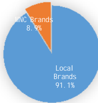
Chart 2: June 2017 mobile phone shipments by local and MNC brands

YTD mobile phone shipments by the local brands reached 215.9 million units, down 4.3 percent year over year, and accounted for 90.5 percent of the domestic mobile phone shipments. Number of new models released by the local brands (533 units) decreased by 26.7 percent year over year, and represented 94.3 percent of the total number of new model release in the domestic market.