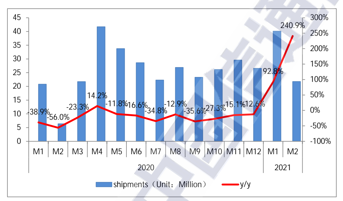
Chart 1: Domestic mobile phone shipments from January 2020 to February 2021

Over the past 2 months, domestic mobile phone shipments were 61.9 million and number of new model were 81, up 127.5 percent and 58.8 percent y/y respectively.