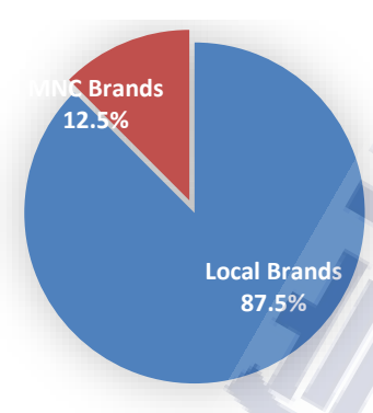
Chart 2: June 2022 mobile phone shipments by local and MNC brands

YTD local brands of Mobile phone shipments were 115.2 million, down 25.9 percent y/y, and accounted for 84.5 percent of the domestic mobile phone shipments. Number of new models released by the local brands were 192 decreased by 1.0 percent y/y, and represented 95.5 percent of the total number of new models.