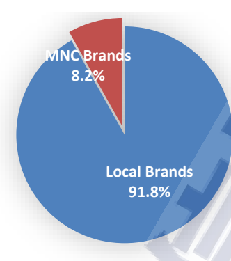
Chart 2: July 2022 mobile phone shipments by local and MNC brands

YTD local brands of Mobile phone shipments were 133.5 million, down 26.4 percent y/y, and accounted for 85.5 percent of the domestic mobile phone shipments. Number of new models released by the local brands were 210 decreased by 3.7 percent y/y, and represented 94.2 percent of the total number of new models.